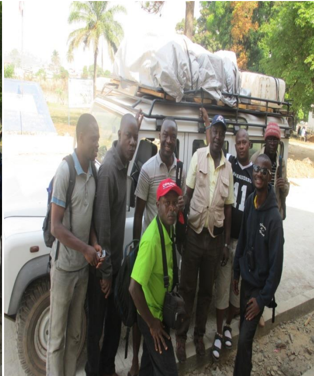
HIES Team 8- Zone 5 Members in Lofa County.