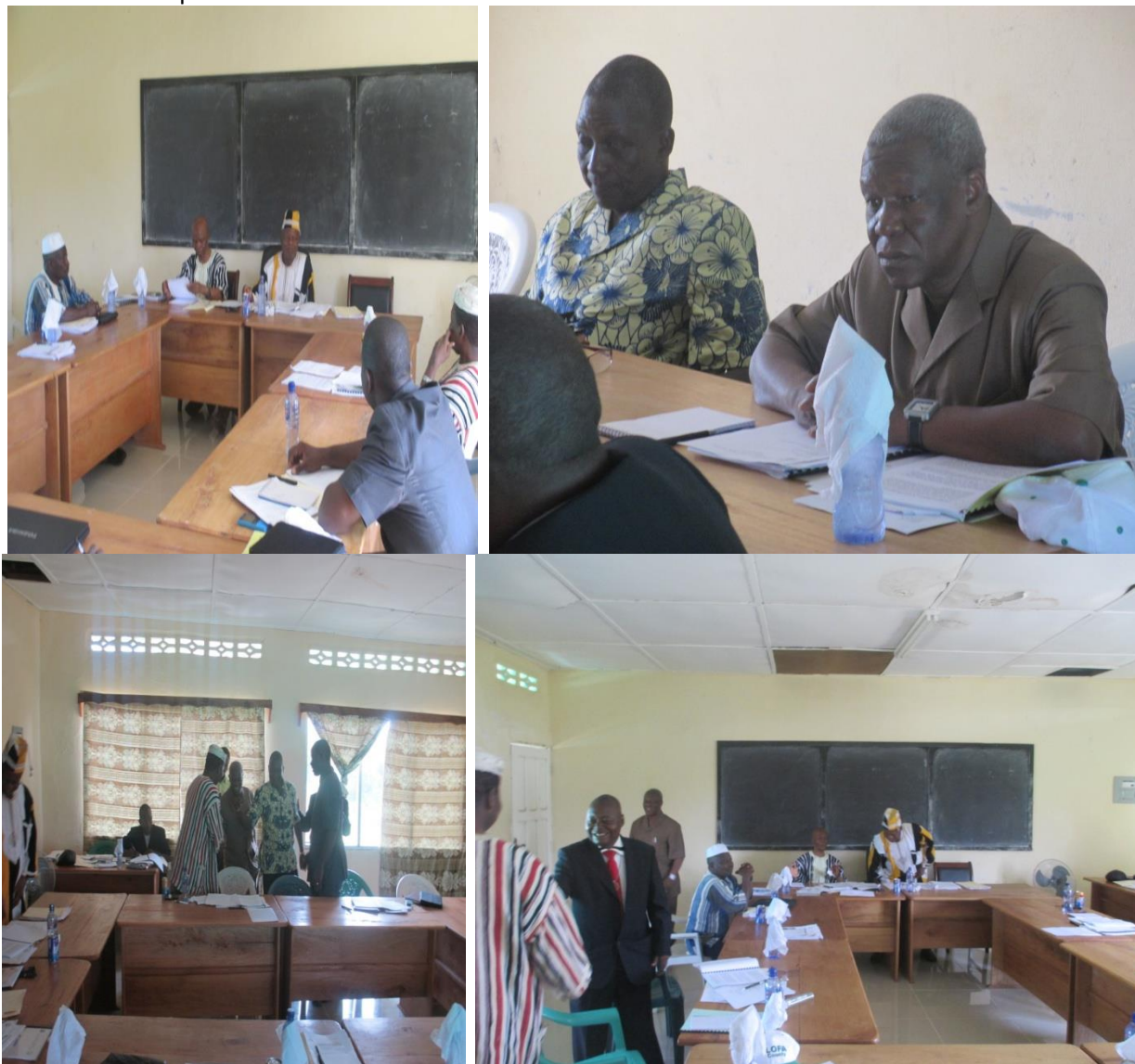
The Board members of LCCC in Session .