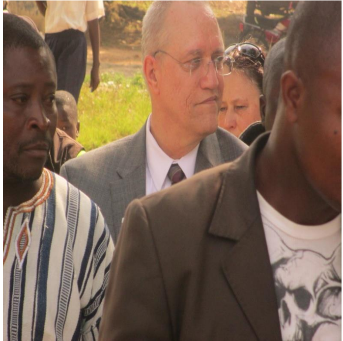
Visit of the City Major of Brooklyn Center, Minesotta,USA, to Voinjama.