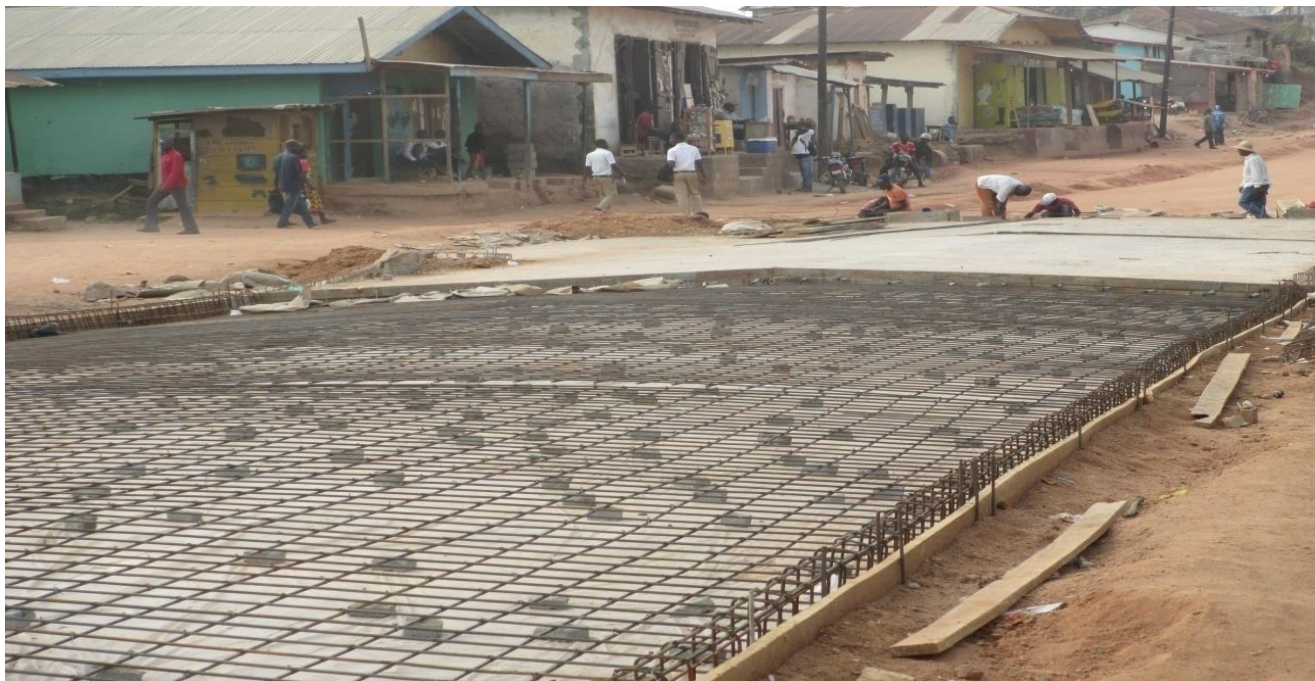
Voinjama City streets pavement

During the Period under review, the CSIO participated in monitored Development projects of Voinjama City streets pavement, County level meetings, and data collections.