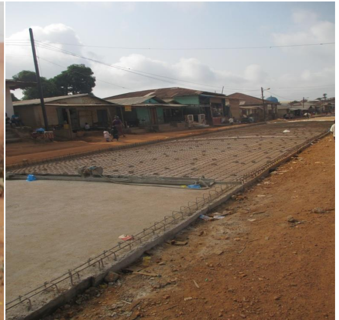
Pevement work ongoing in Voinjama City.