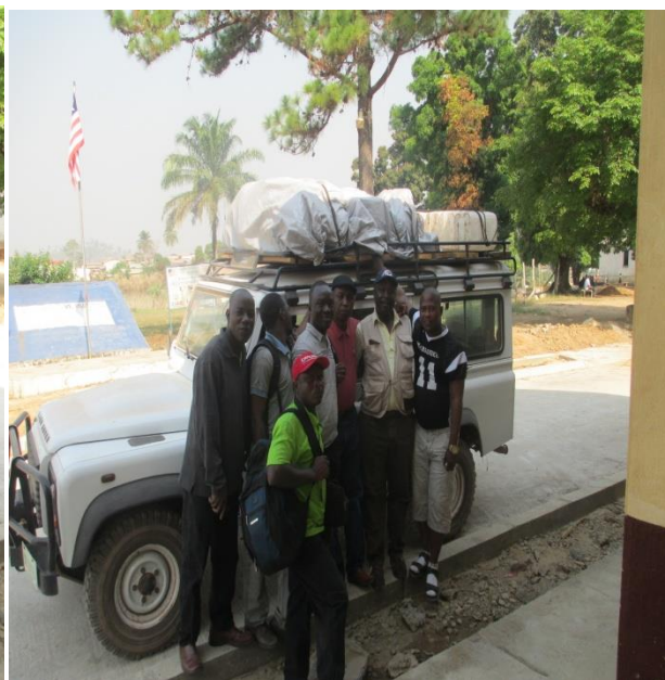
HIES Team 8- Zone 5 Members in Lofa County.