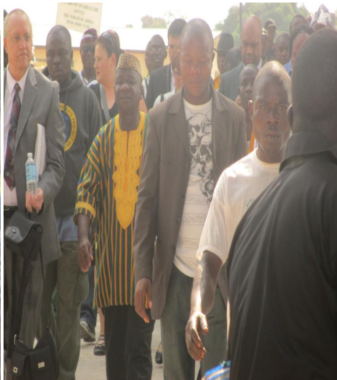
The Visiting Team from Brooklyn Center, Touring the City of Voinjama.