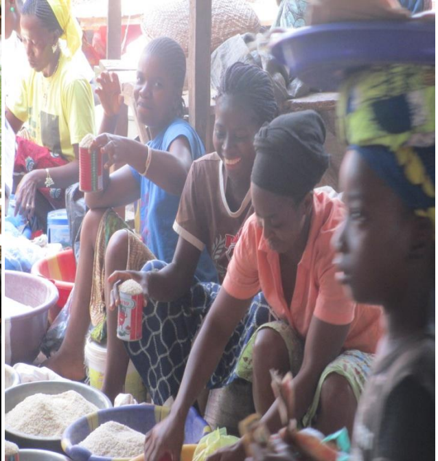
Price monitoring in Voinjama and Foya Markets.