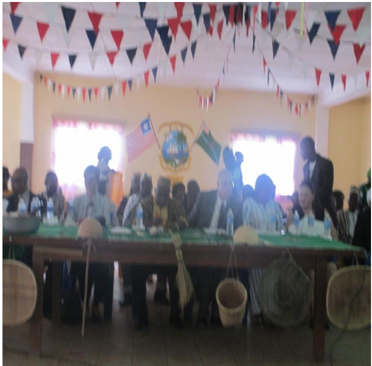
Visit of the City Major of Brooklyn Center, Minesotta,USA, at the County Hall.